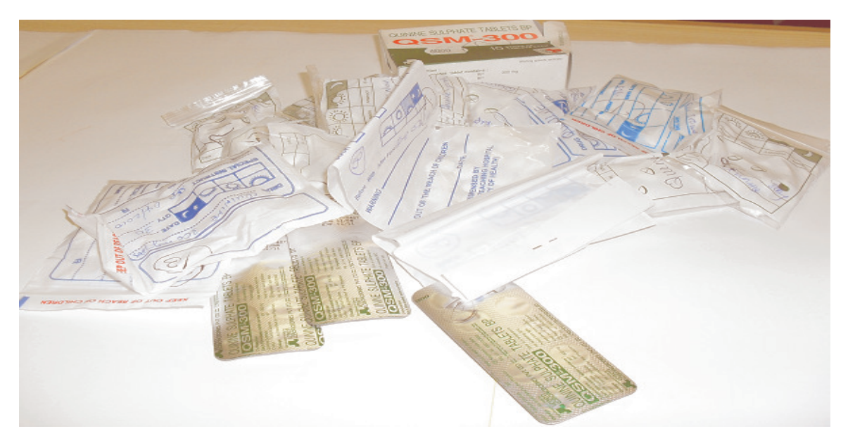
Figure 4: Quinine sulphate tablets collected for quality analysis.