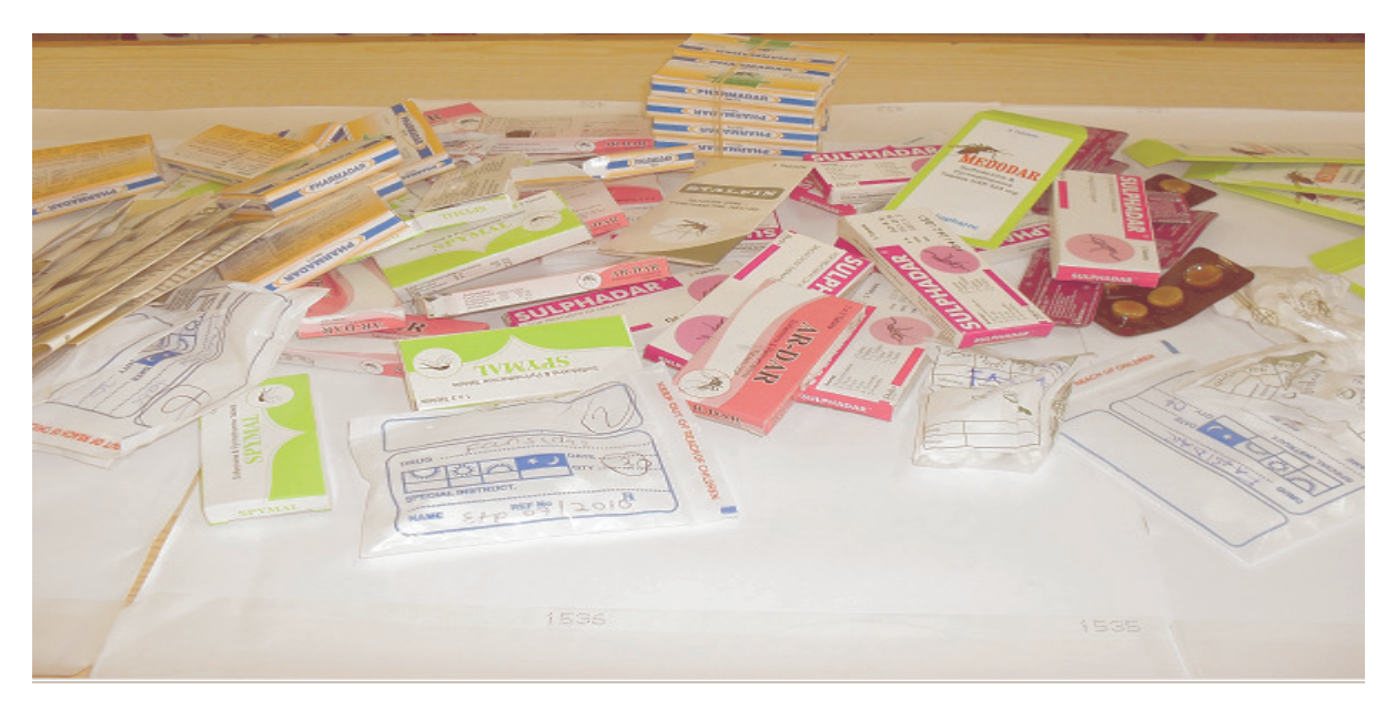
Figure 3: Sulphadoxine/Pyrimethamine tablets collected for quality analysis.