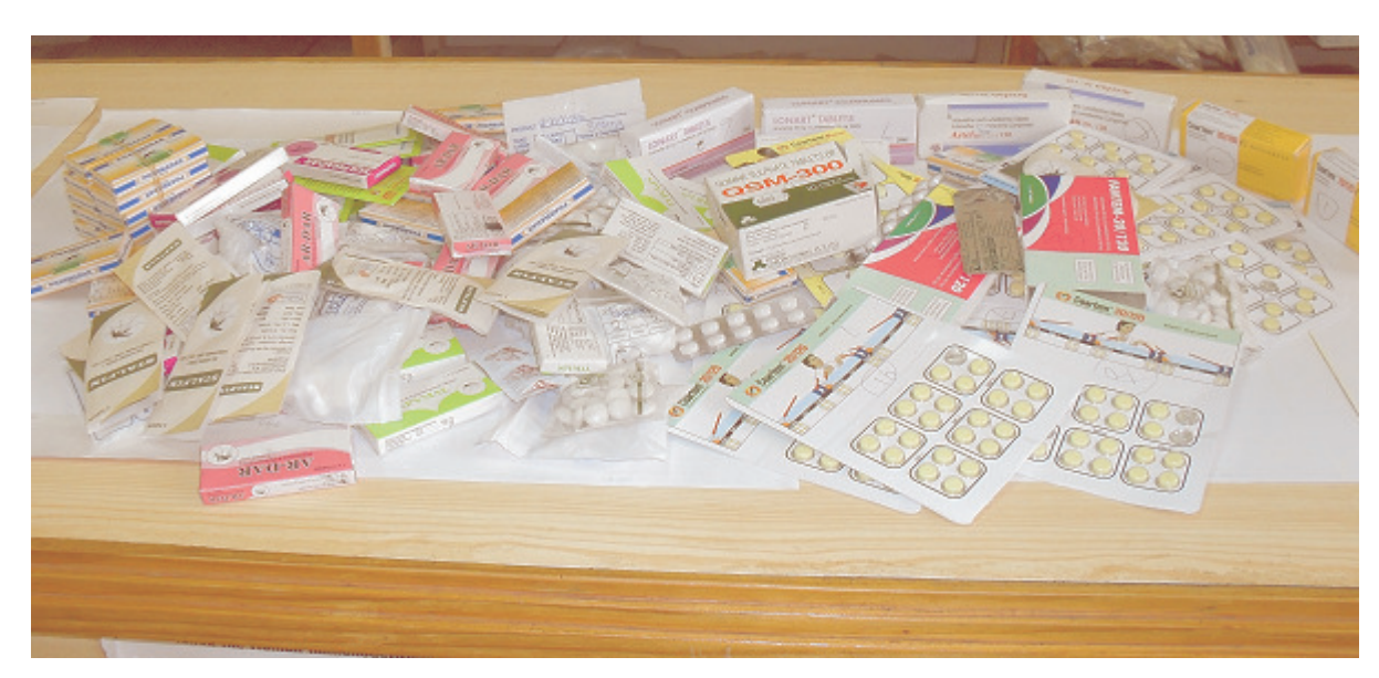
Figure 1: All antimalarial drug samples collected for quality analysis.