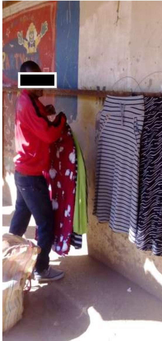
Figure 2: Male Youth Displaying Clothes for Sale