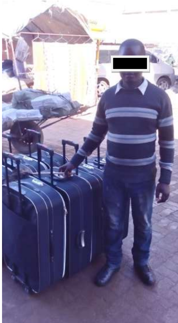
Figure 3: Male Youth Cleaning Suitcases at his Stand