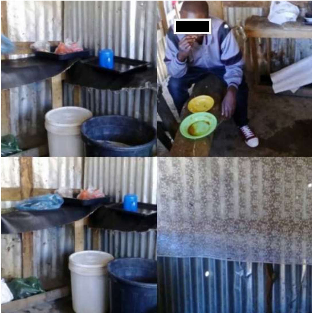
Figure 1: Photo of Customer Having His Meal at a Restaurant Run by a Female Youth in Kamwala Trading Area