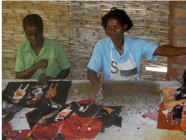
Figure 7: Tie and Dye skill

like plain clothes and the dyeing materials are able to utilize this skill for their survival after the course. The figure below illustrates some participants displaying the dyeing skill.