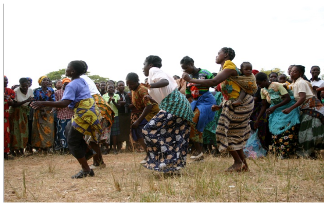
Figure13: Participants involved in dance drama

Figure seventeen below illustrates the practical application of dance drama skills applied in the community.