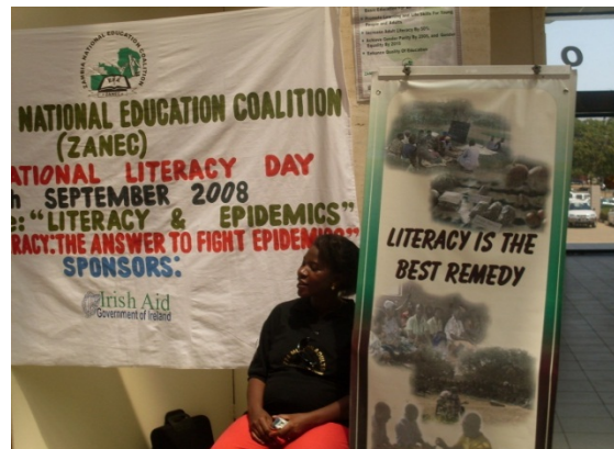
The figure 2: Literacy is the best remedy

Coalition and People's Action Forum in (2008) on the literacy day claimed that literacy is the best remedy for many social problems in the society. See the figure below.