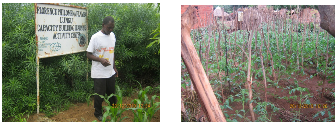
Figure 11: Agriculture skills (A demonstration field and A participant's tomato field)