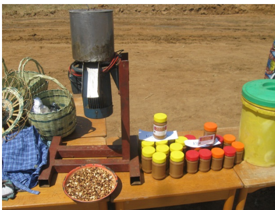
Figure 4: Peanut Butter making machine

Below are figures illustrating samples of the peanut butter made and disposed at the market for sale.