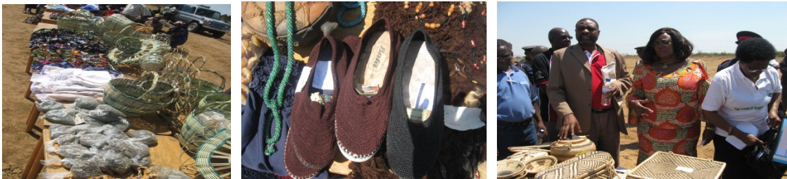
Figure 17: A variety of products on the market.

The participants in the programme who are in the community disclosed a number of products which they said are a product of the Neganega literacy programme. They indicated that the skills learnt in the sessions during the literacy lessons, helped them to come up with different products and initiatives necessary to uplift their lives. For those who ventured in the production of market materials for sale using the knowledge gained from the Neganega literacy programme made reference to the products as shown on the figure below.