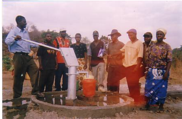
Figure 14: A field visit to a site of interest.

When a problem was identified in a particular community, members could go to such a place so that they find means and ways of handling such a problem. A typical example is when there was a problem on how to utilize the borehole effectively to meet their needs in the community. The community through the participants organized themselves to go and settle that problem at the borehole as illustrated in the figure below.