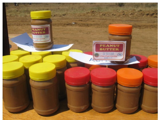
Peanut Butter ready for sale

Peanut butter is good for the body and it is easy to make. It does not involve complex chemicals and packaging is also simple and friendly.