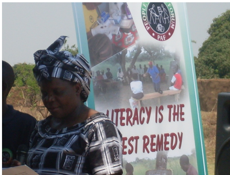
Figure 15: Reflect method illustrated in pictures.

This method involves participants reflecting on how best they can handle a particular problem in the community through planning, acting and reflecting regularly. The figure below in the background models a sample reflect circle.