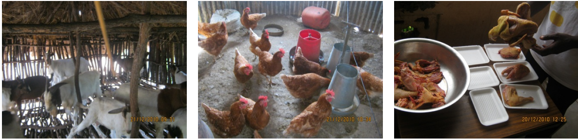
Figure 6: Goat keeping, Chicken Keeping and Packaging for market

In appreciating these skills, one of the respondents said