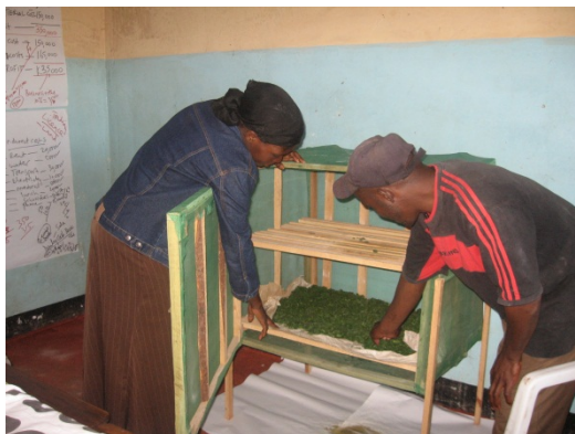
Figure 9: Vegetable dryer

With new literacy skills, community members were urged to build vegetable drying facilities such as the sample figure illustrated below drawn from the programme.