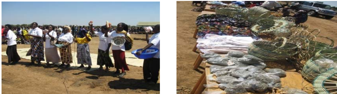
Figure 12: A display of a variety of products on the market.

Respondents in the study indicated that they were involved in active production of products for sell as a result of the skills learnt from the NLP. They had put on the market products of different kinds like baskets, peanut butter, sausages, Moringa powder, jam, table cloths and door mats. Below is a figure illustrating some of the products displayed by the participants of the neganega literacy programme on the international literacy day.