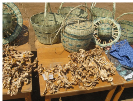
Figure8: Basket related making skills

Weaving is another skill being taught in this programme. This skill is also extended to making other traditional staff like reed mats and huts. Learners are exposed to areas where such skills are taught by experts who were either trained from the traditional background or just learnt the skill whilst on this same programme. The facilitators for such skills indicated that they were well informed and ready to transmit the knowledge to those members of the community who were interested. The figure below illustrates the products made from such a skill.