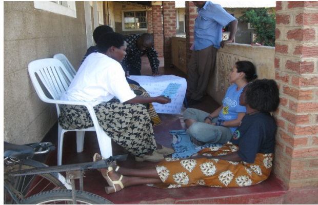
Figure 18: Facilitators Share ideas

A sample training session is shown above and below for facilitators led by a trainer of trainers. Facilitators meet monthly and annually for training sessions.