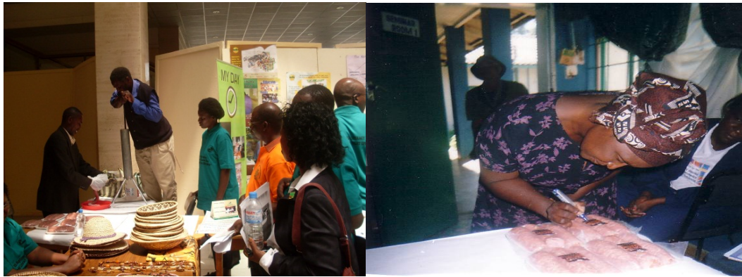
Figure 5: Filler Making Sausages and Packaging of Sausages

The study also found out that there was a sausage making skills training programme at some centers. Learners in the community were being taught how to make sausages taking advantage of the abundant domesticated animals like cattle and goats in Mazabuka district.