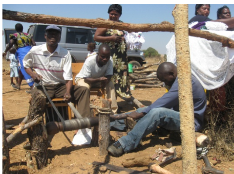
Figure 10: Men in the Carpentry process

The figure below illustrates the process involved and some items made in applying such a skill in the community.