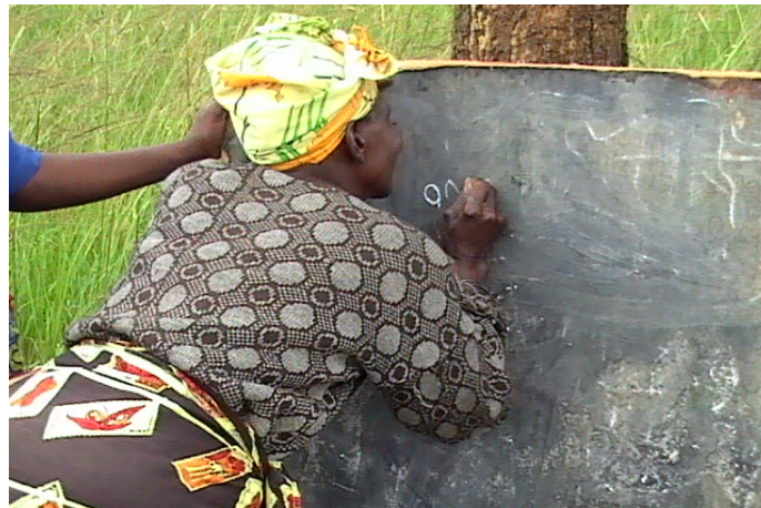
Figure 3: An adult practicing reading and writing literacy skill

It was also noted that learners at the Neganega site were being taught reading and writing skills in their indigenous language familiar to them. They learn how to write their names and other things within their immediate environments in exercise books or on chalkboards. Figure 7 below illustrates a writing skill from the learner.