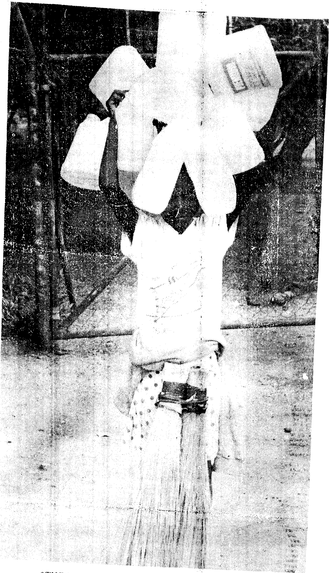
*THE law protects children from this kind of abuse.