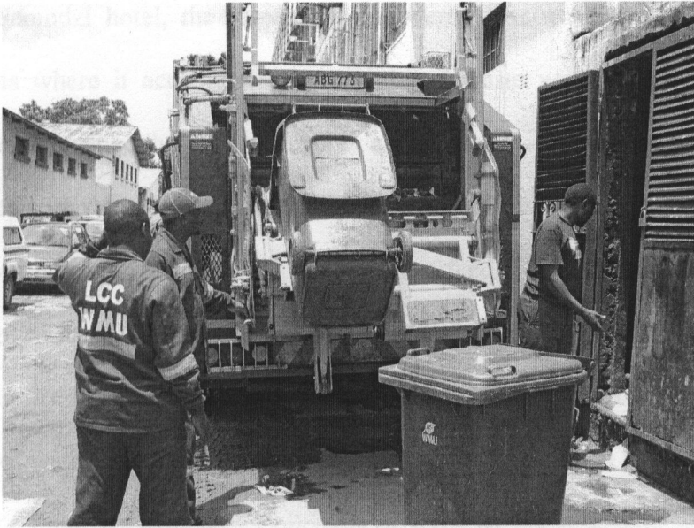
Plate1. LCC, WMU collecting waste bins from a waste room at a hotel in Lusaka

The researcher's visit to these hotels and lodges disclosed that some of these institutions used open drums without lids. The researcher was not allowed to take any pictures inside these premises. Collection of waste by various contractors was done three times a week, on Mondays, Wednesdays and Fridays. No sorting of waste was done by the hotel and lodge institutions and when asked why they handled waste in the manner they did, all the institutions involved said they did not know any other way of handling waste. This aspect denotes a need for EE in waste management for such respondents.