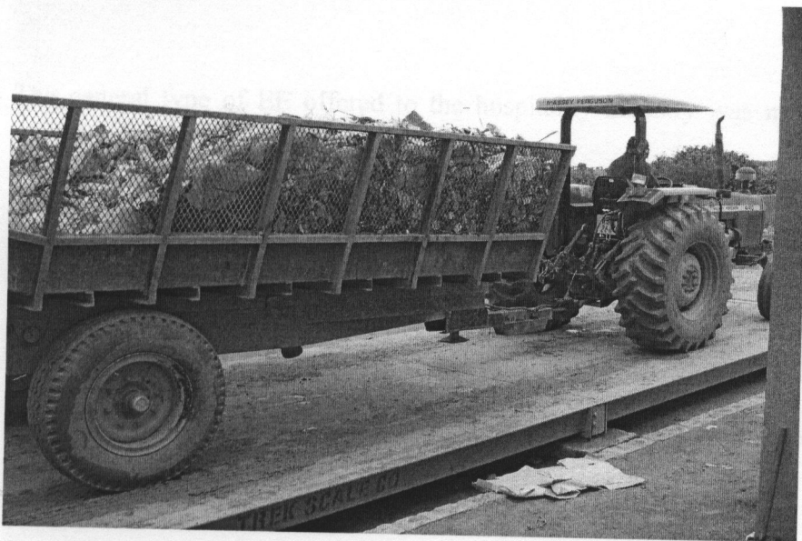
Plate 6. Waste being transported to old Chunga landfill site