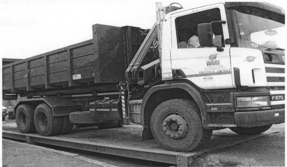
Plate 4. LCC, WMU waste truck on Weigh Bridge at old Chunga landfill