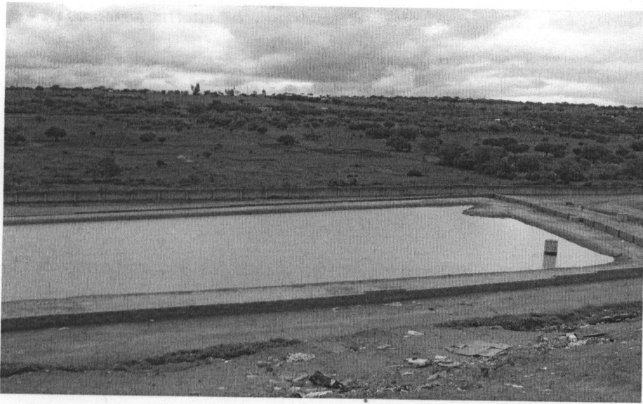
Plate 9. Leach dam at new modern Chunga landfill site.

The final conclusion of the study was on the assessment of the EE on waste management provided to the hospitality industry. The conclusions were that the hospitality industry's view was that there wasn't enough communication between the EE providers and themselves. As a result, there was lack of commitment by both parties in the provision of EE. There was a weak monitoring system on the EE being provided. On the part of EE providers, the hospitality industry assessed that there was lack of knowledge about the hospitality industry EE needs by the providers. As a result, they remained general and not specific to the needs of the industry.