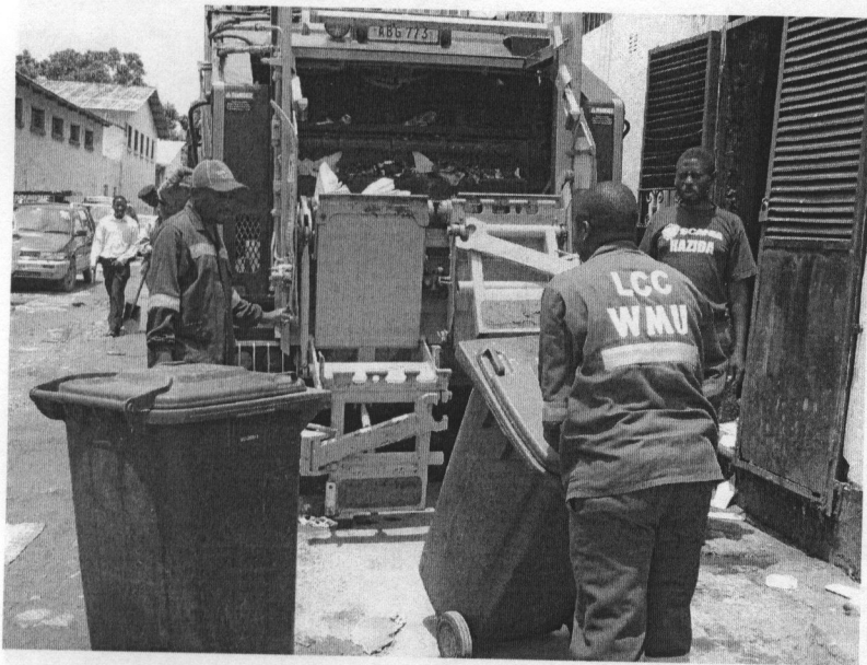
Plate 5. LCC, WMU collecting waste at a hotel

helps the study to conclude that the management of waste in the city of Lusaka is of general nature.