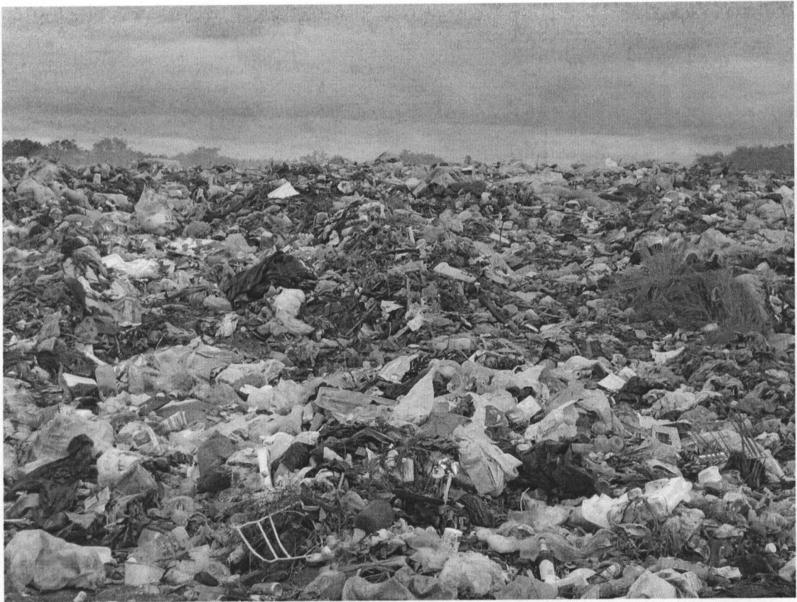
Plate 3. Waste left on the heap after scavengers had sorted and picked whatever they wanted

At old Chunga landfill the researcher was informed that most of the waste which reached the disposal point was from the hospitality industry. This tended to be wet and caused leaching. There was a lot of water coming out of the heaps as the waste was decomposing.