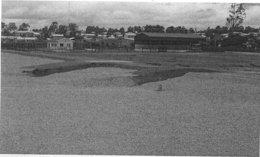
Plate 8. Dumping area at new modern Chunga landfill site.

industry was of a mixed form at the landfill. The mixed form of this waste led to the leaching effect at the landfill. As a result, in the construction of a new landfill, LCC had included a leach dam which would be treated and managed according to modern technology (see plates 8 and 9 below. The inclusion of a leach dam in the new landfill at Chunga was meant to accommodate waste from the hospitality industry which is mostly in a wet state.