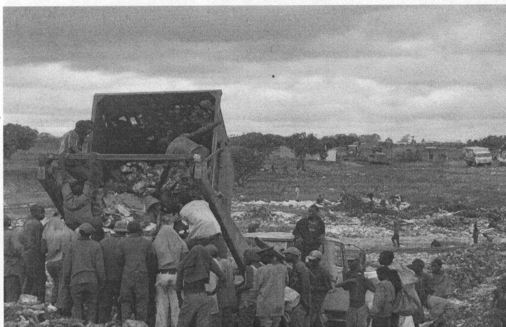
Plate 2. Scavengers scramble for items from the waste being offloaded at old Chunga landfill

At the only designated Chunga landfill, it was observed that the waste received was not sorted out. Both dry and wet waste including other types of waste were carried in one container and off loaded on to a common waste heap where vendors and other scavengers sorted and picked out whatever they wanted. (See pictures below)