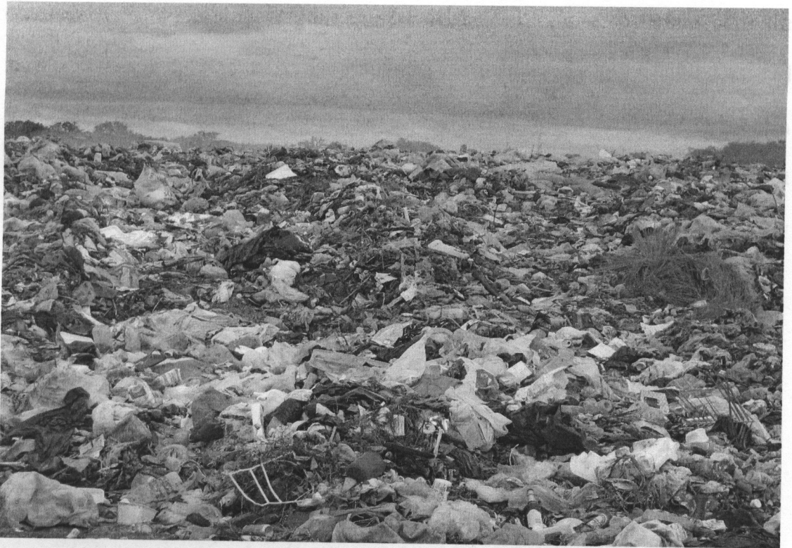
Plate 7. Waste disposal at old Chunga landfill.

The general type of EE offered to the hospitality industry was more relevant to other industries such as residential and commercial areas which generated more waste than the hospitality industry. However, most of the waste which reached the designated landfill was discovered by the researcher, during the research to have come from the hospitality industry. It can be concluded that this was so as the hospitality industry was more mindful of the consequences of keeping waste in its vicinity. Accumulated waste at hospitality institutions would lead to loss of business and reputation.