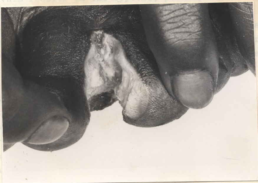
Fig.3: Condylomata lata between the toes

They may also be found on the cervix and sometimes on the vaginal wall. Extragenital primary chancres of the mouth, fingers, breasts, eyelid, ear, between toes (Fig.3) have also been reported.