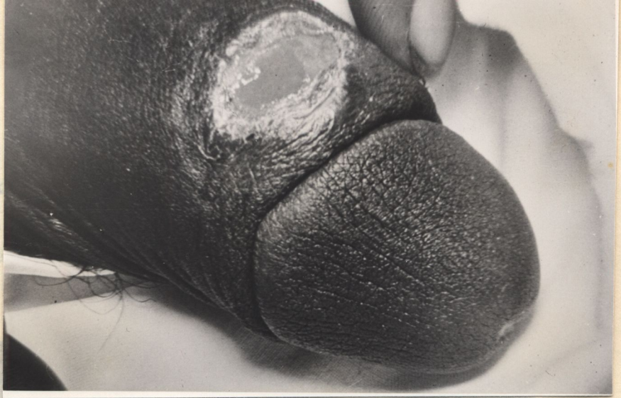
Fig.1: Primary syphilitic chancre on the genitalia in a male patient.

They may also be vaginal wall. Ex fingers, breasts, also been reported