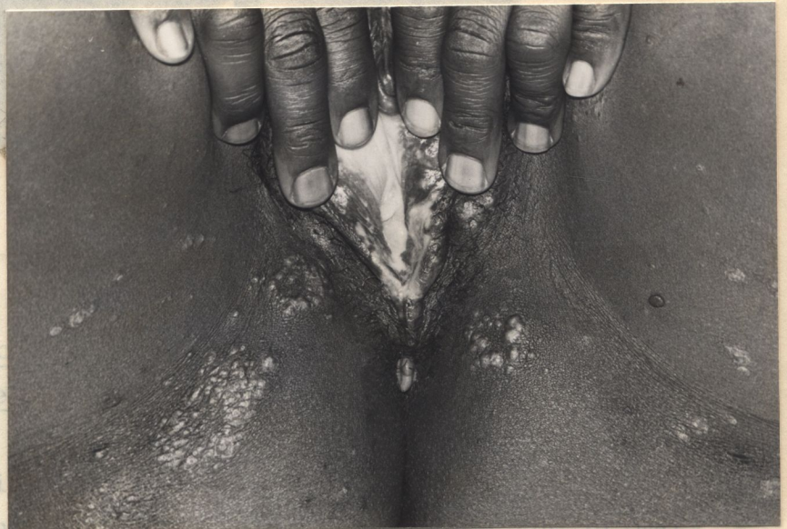
Fig.3: Co be