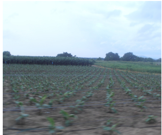
Banana Plantations under Threats from Wild Animals in Chiyaba GMA