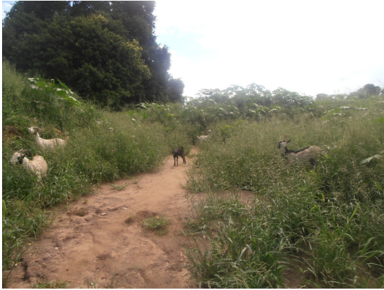
Domesticated Animals often attacked by Wild Animals in Chiyaba GMA