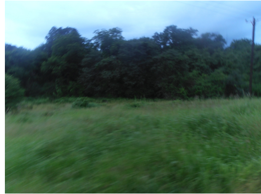
Vegetation of Chiyaba GMA Dominated by Miombo Species