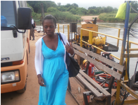
The researcher on her way from Chiyaba GMA