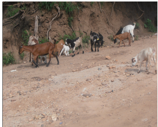
Domesticated Animals often Attacked by Wild Animals in Chiyaba GMA