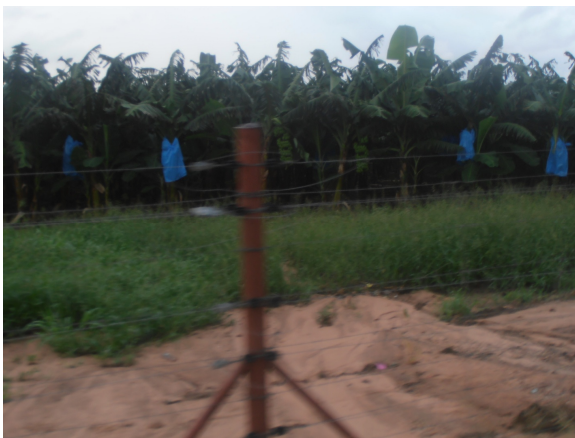
Banana Plantations under Threats from Wild Animals in Chiyaba GMA