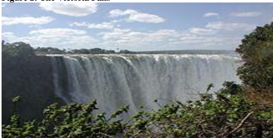
Figure 2: The Victoria Falls

The major tourist attraction in Livingstone is the Victoria Falls. Its fame hails from 1855 when Scottish missionary and explorer David Livingstone became the first European to explore the Zambezi River from Angola and on his way to Mozambique where the river terminates in the Indian Ocean, saw the falls and named it the Victoria Falls after Queen Victoria. He was taken to the falls by the Subiya/Kololo Chief Sekeletu. In 1864 the Lozi threw off their Kololo masters and re-established their dominance over the Subiya and the Tokaleya in the vicinity of the falls, which became the South-Eastern margin of the greater Barotseland kingdom.