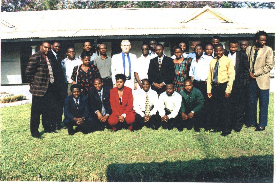
Figure 6: Customer Care Seminar for Marketing and Public Affairs Group Photograph