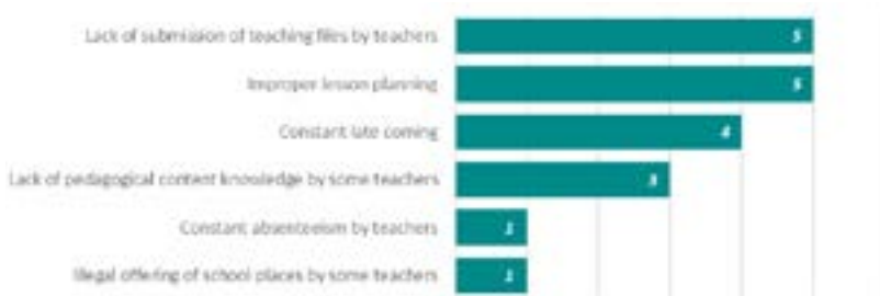
Figure 5: Administrative/Managerial causes of power related conflicts according to head teachers

Of the 5 headteachers interviewed on the causes of administrative/managerial power related conflict, 5 headteachers mentioned lack of submission of teaching files by teachers, another 5 mentioned improper lesson planning while 4 indicated constant late coming by teachers. On the same question, the study revealed that 3 headteachers mentioned lack of pedagogical content knowledge by some teachers, while the remaining last two categories of responses; constant absenteeism by teachers and illegal offering of school places by teachers were mentioned by headteachers each.