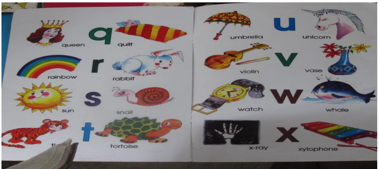
Figure 4.2: Picture – Word chart photographs taken at Kilimanjaro pre-school