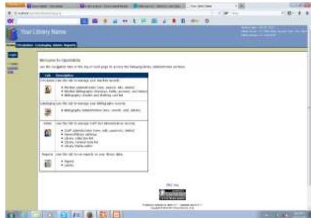
Fig. 2. Customization and use of OpenBiblio

OpenBiblio is among the easy to customize and use library management systems I have worked with. The founder's principle was to develop a simple to install and use library management system. This has indeed turned out to be the case. OpenBiblio has the Administration icon where the system administrator logs in to customize the system; by editing the name of the library, setting up user accounts, etc. Further, using OpenBiblio is easy as functions such as cataloguing, circulation and reports generations can be done with easy. Unlike in Koha and other library management systems where reports generation requires knowledge on how to write a query in SQL, OpenBiblio has made it easy for library staff to generate queries on stock circulation, users, etc and are displayed in Portable Document Format (PDF). In addition, barcodes for the catalogued materials are easily generated and can be printed from a barcode printer.